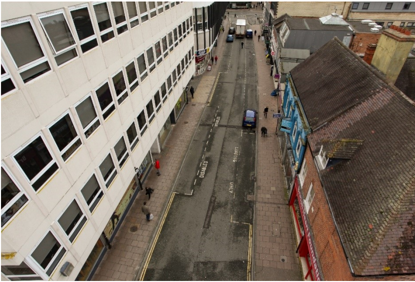
Claremont Street February 2020