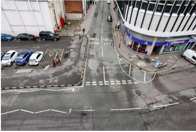
Bellstone/Barker Street/Claremont Street February 2020