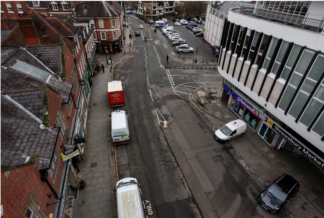
Bellstone February 2020