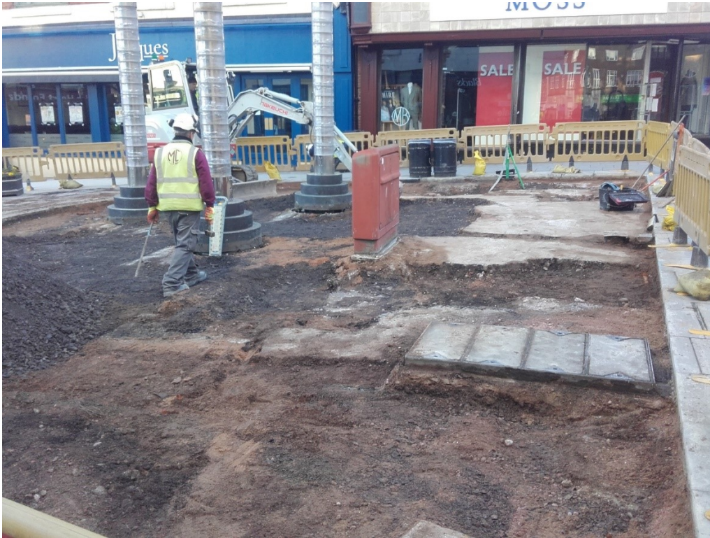
Excavating Darwin's Gate Square to prepare for new granite paving