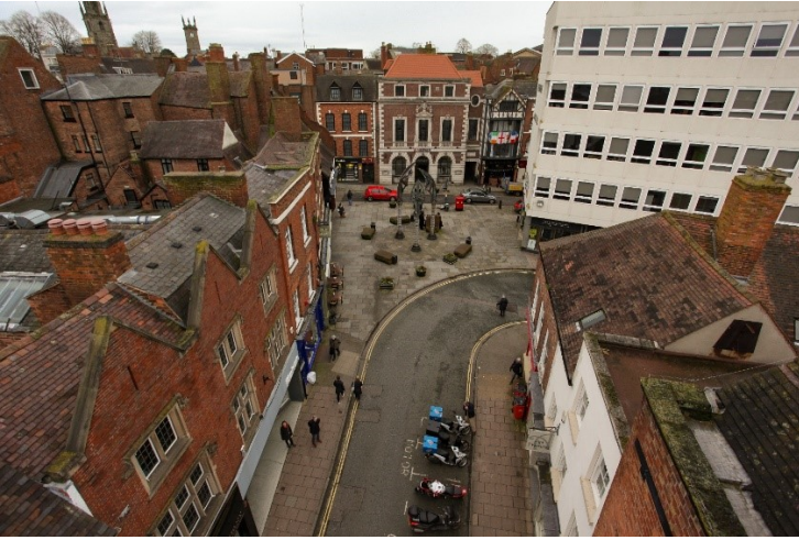
Mardol looking to Darwin's Gate February 2020