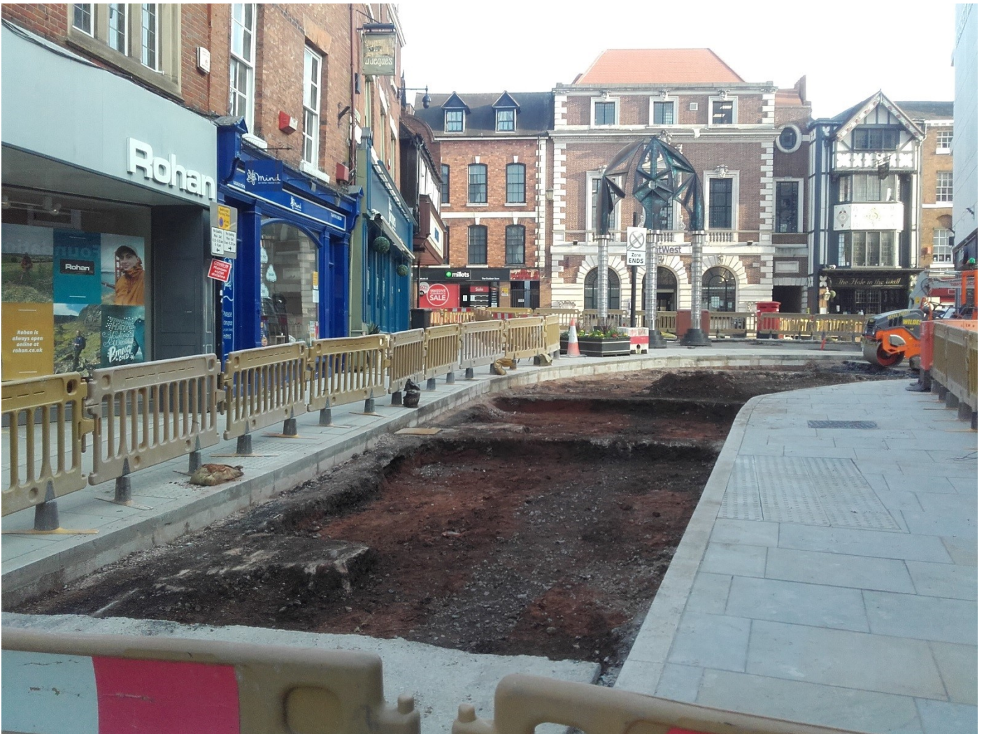
Excavation of old carriageway in preparation of new concrete sub base and york stone setts

The lower section of Claremont Street will also have been surfaced with new tarmac by the time this newsletter is issued.