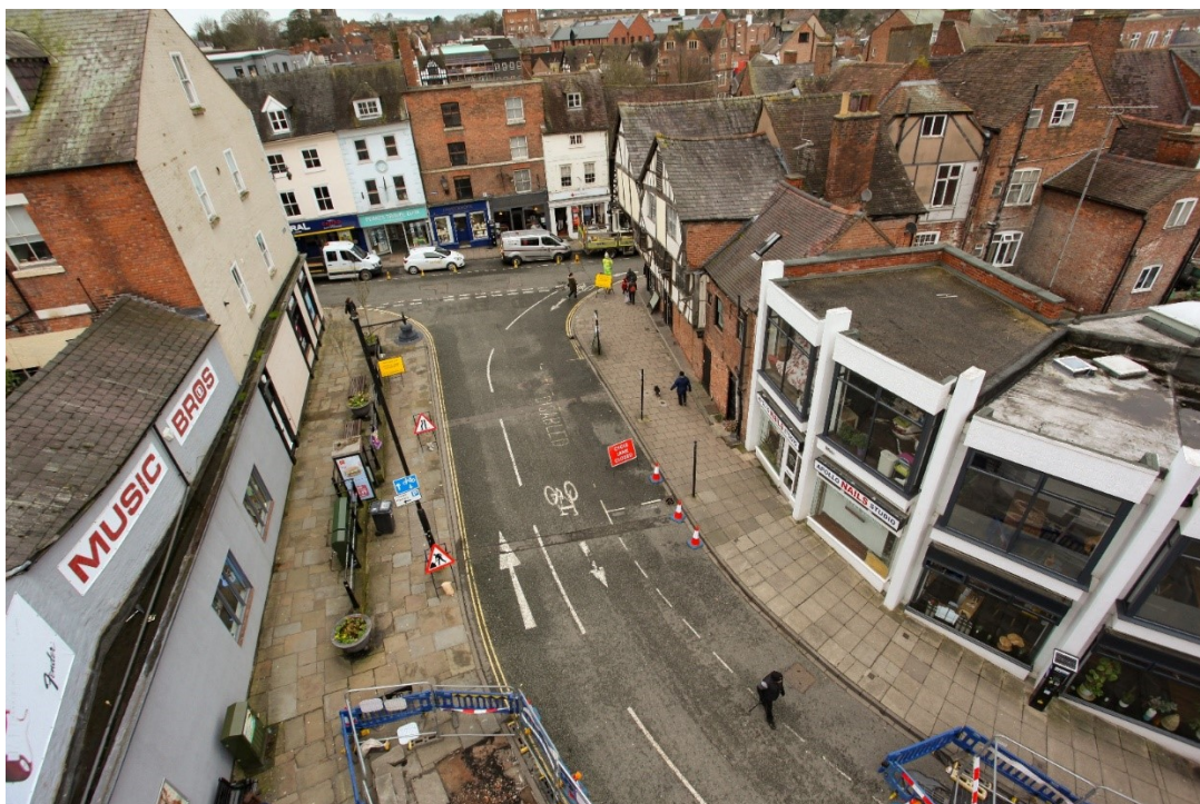
Roushill/Mardol junction February 2020