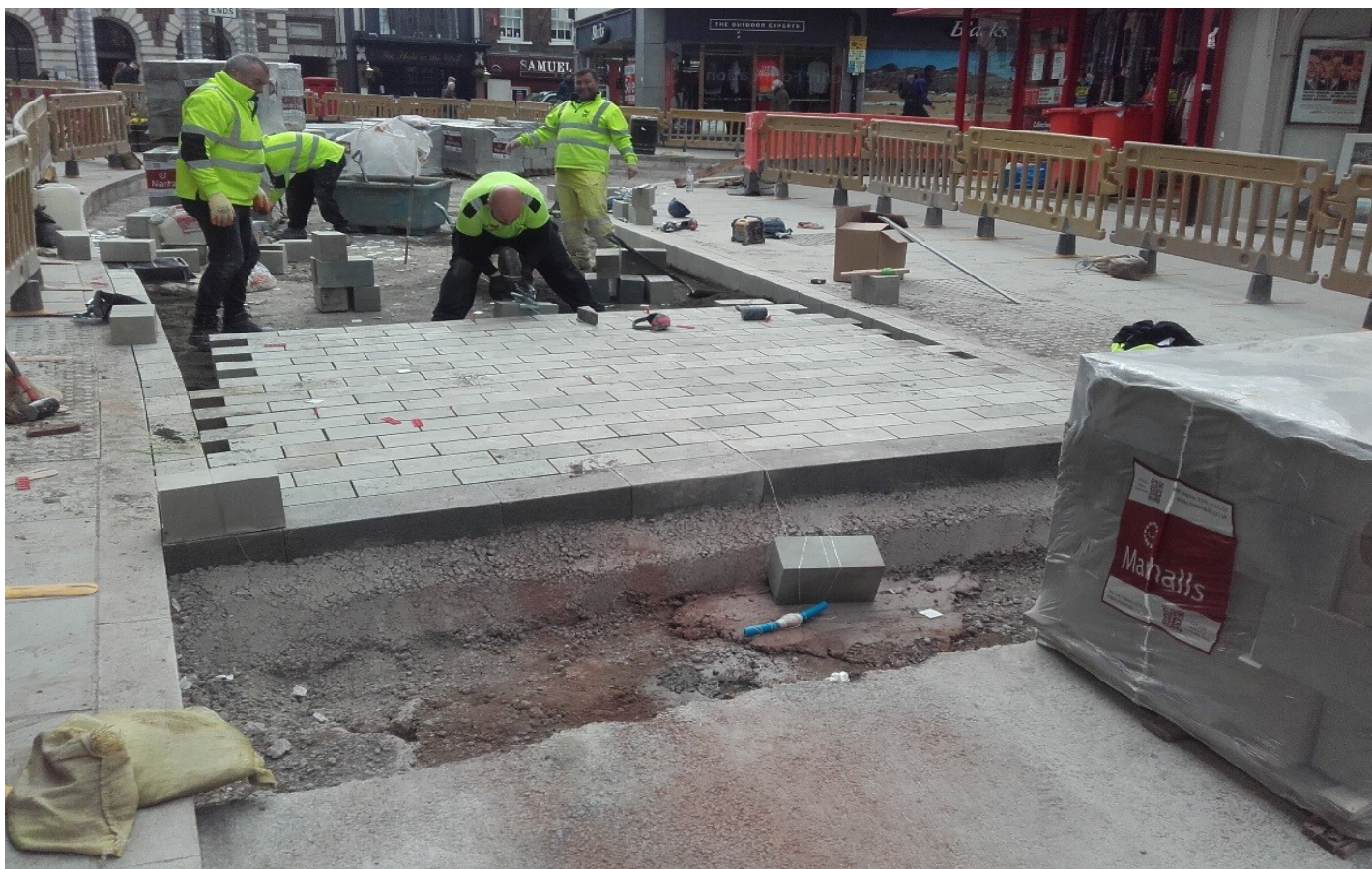
Laying york stone setts to carriageway from Mardol into Claremont Street