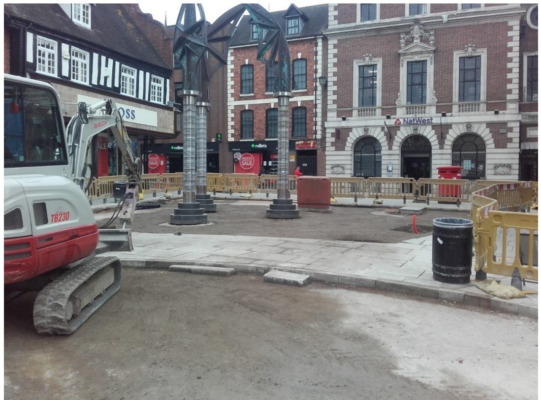
Concrete sub base laid in Darwin Gate Square