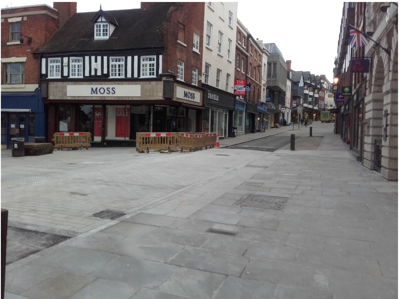
New pedestrian crossing area on Shoplatch

Footways were re aligned through this location and a raised table formed to create an improved, level, designated crossing area for pedestrians.