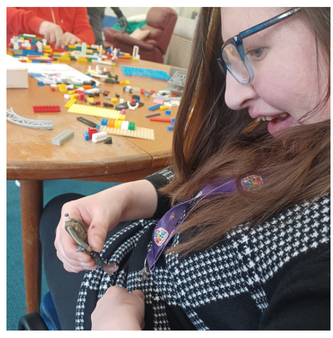
Lego Challenges Ideas

Build a Lego piece of furniture, that has 4 legs.