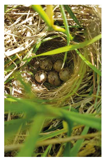
Figure 3. Skylark nest.

have a clear preference for vegetation height of between 20 and 60 cm, although taller crops such as linseed and rapeseed can be tolerated where the vegetation is less dense at ground level (Toepfer and Stubbe 2001).