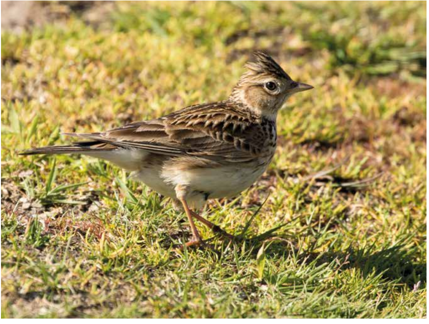
Figure 4. Skylark on the ground.

Use survey data to quantify the number of breeding territories in the development footprint. Example: 20 territories.