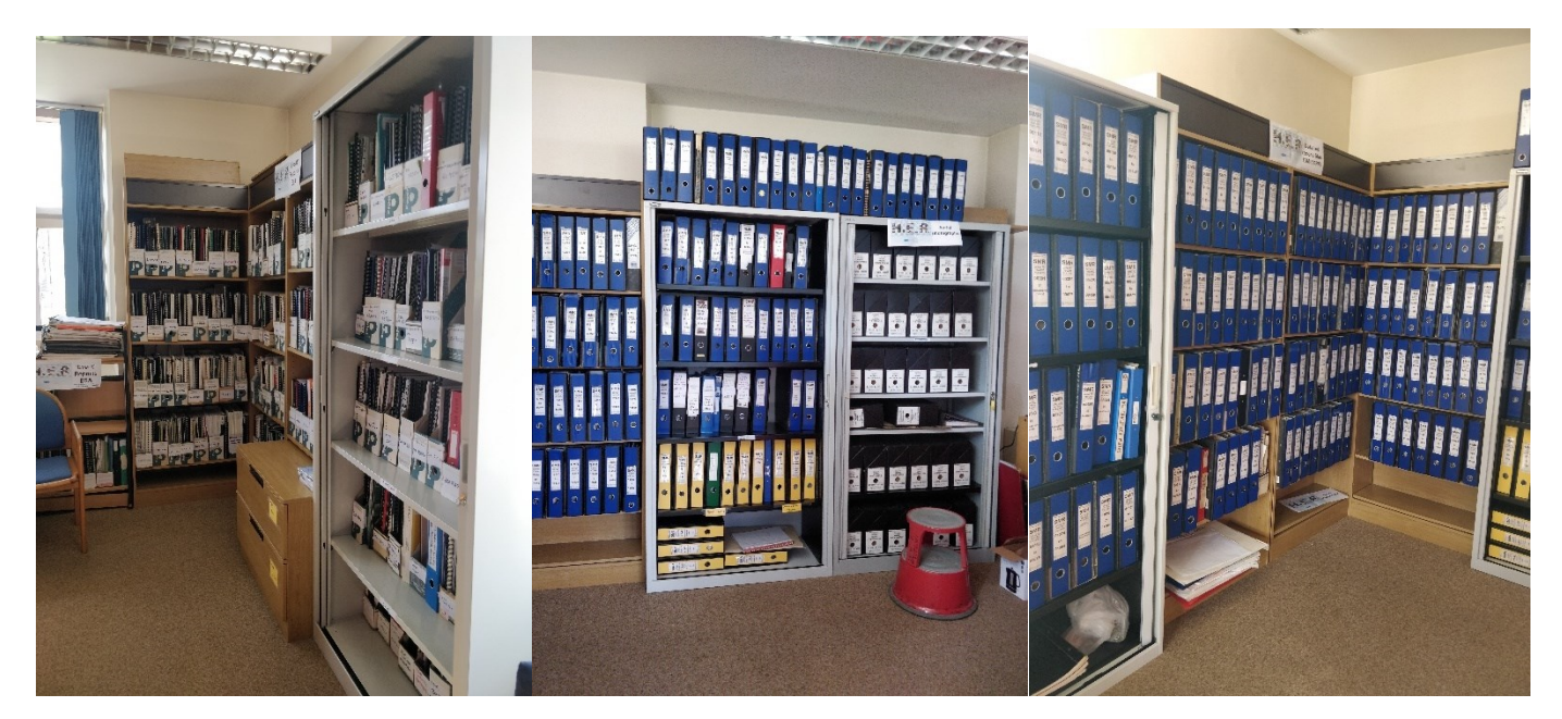
We hold extensive photographic and survey material of the buildings, sites and landscapes of Shropshire which support our records. Much of the source material is held at our offices in Shrewsbury Library, and is available for consultation by appointment.