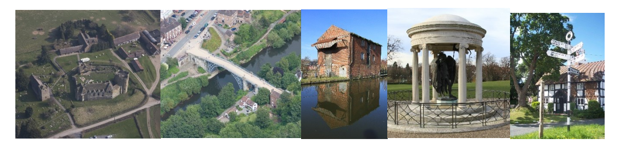
From I-r: The standing remains of Stokesay Castle; The Iron Bridge; Canal Warehouse, Ellesmere ; Shropshire War memorial, The Quarry, Shrewsbury; Upton Magna

We maintain full records on desk-based and field-based investigation in the county and are the repository for archaeological fieldwork and historic building investigation and recording carried out in the county. This is often as a result of development projects, and includes a wide range of material related to the intervention history of heritage assets across the county.