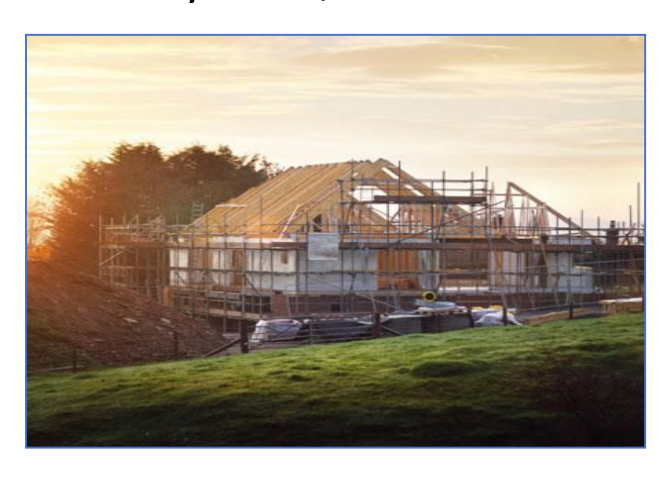
Darby Close, Nesscliffe

Developers can advertise free of charge on our Self-Build website by simply contacting our team. Some examples of the plots currently available are shown below.