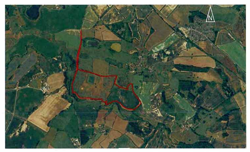
Figure 1. Site location and wider landscape (site indicated by white line boundary)

The site was located on the land to the southwest of Berrington, Shrewsbury, SYS 6HQ (Central Grid Reference: SJ 52 312 06495). The site was comprised of large arable and grassland fields approximately 44.06 ha, within one of these fields was a large lagoon. The site was bound by narrow single-track roads along the eastern, northern, and western boundary which led to arable fields in the east, livestock fields to the north. A small woodland to the south concealed Cound Brook which is approximately 3 m wide and relatively fast flowing. The wider area generally consists of arable farmland with small residential areas to the north-east, west, and south. To the north of the site is Berrington Pool Site of Special Scientific Interest (SSSI). Figure 1 below shows the site boundary.